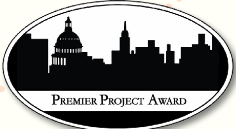
TCRPC's Premier Project Awards recognize planning excellence in Dauphin County.