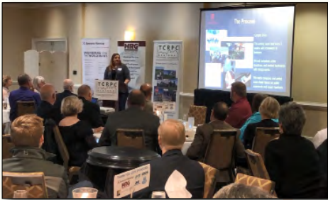
TCRPC's annual luncheon is a great opportunity for elected leaders, municipal officials, planners, developers, engineers and others to dine together, network and discuss the region's future.

To take advantage of these opportunities and support TCRPC's mission in 2022, including our various promotional efforts, please visit www.tcrpc-pa.org/sponsorships and submit your sponsorship form soon!