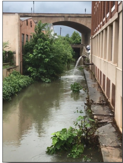
Paxton Creek, Harrisburg