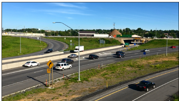
I-83 split from Lowther St. overpass, Lemoyne