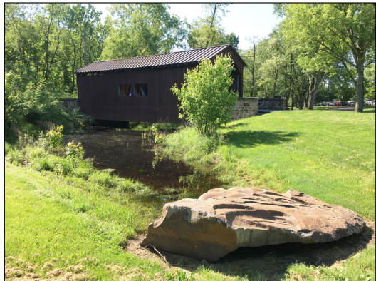
Fort Hunter, Harrisburg

The directions identified under each of these focus areas are summarized in the following pages.